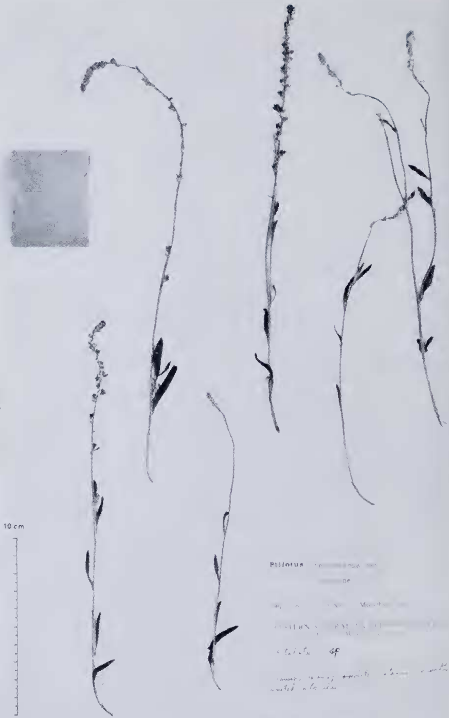
Figure 2. Pilotus tetrandrus Benl. Holotype sheet. Coll. R. B. Hacker No. 97, 2 October, 1974, near Carlsakes Well, Glenorn Station, Western Australia. PERTH. (new data supplied by Mr. Hacker after the photograph was taken)